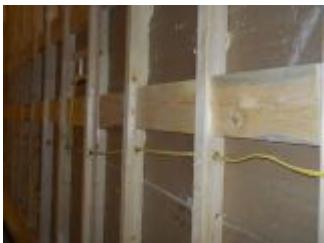
Blocking installed behind drywall for fastening of all wall and base cabinets.