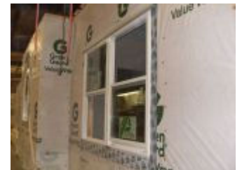
Perfecto Wrap Door and Window flashing to seal against water and air penetration.