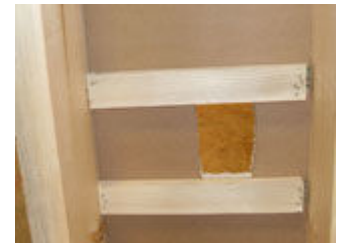
Blocking installed behind drywall for all electrical boxes to provide extra support.