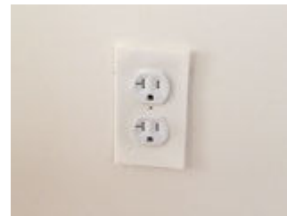
Gaskets behind all electrical boxes installed on exterior walls to insulate and provide protection of drafts.