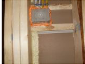
Spray foam used on exterior side of electrical boxes installed on exterior walls to ensure maximum energy efficiency.