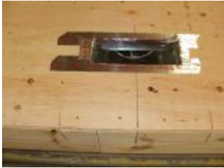
Floor Boots for HVAC sealed to the floor using Shurtape to ensure an air tight seal.