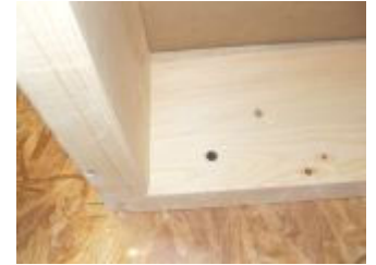
Walls are initially placed and fastened with nails before being screwed for a final extra sturdy connection