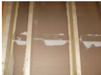
Horizontal drywall seams reinforced with excess drywall cutoffs and drywall mud to ensure stronger seams.