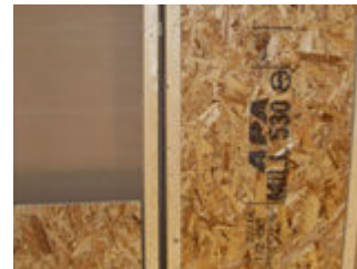
OSB backer boards installed behind drywall for Shelf and Mirror installation providing a secure area for fastening.