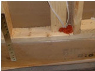
Corners and Perpendicular intersections of walls are lagged into place using 1/4" lags for additional structural rigidity.