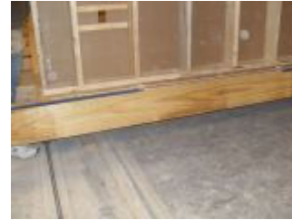
Exterior walls are set on top of a thick bead of caulk to assure an air tight seal to the floor system