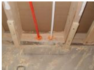
Spray Foam applied at all exterior framing penetrations to ensure a more air tight home.